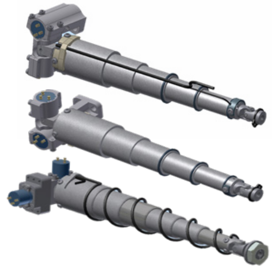
Figure 1: Three of the six varieties of devices used in THOR, upper thorax, lower thorax and abdomen, all right hand shown.

An update to the THOR-50M IR-TRACC (Infra-Red Telescoping Rod for Assessment of Chest Compression) calibration adaptors provides improved mounting assembly convenience to the linear transducer calibrator fixture.