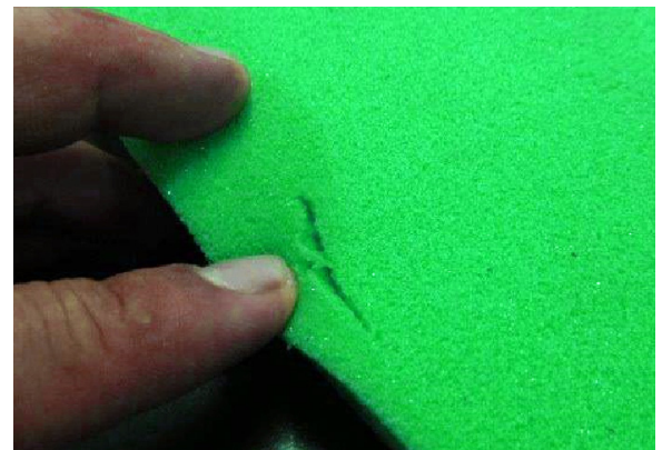
Figure 2 - A small tear observed in the face foam after impact certification